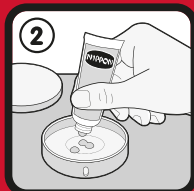
2 Remove the lid of the bait station and add 3-4 drops of Ant Killer Liquid