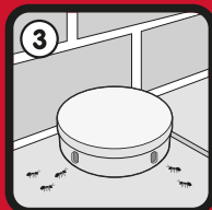
3 Re-seal the lid and place the bait station on or near the ant run